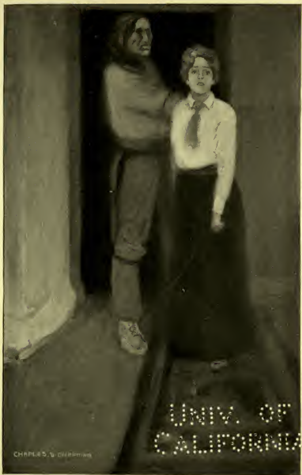
"I have more to do with it than you think," she replied.